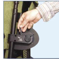
Assembly fasteners Two lateral anchors to easily remove and reinstall backrest without changing settings and adjustments.