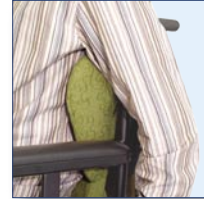
Lateral supports Choice of four supports, according to user's size and condition.