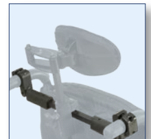
Reinforcement bar (optional) To stabilize wheelchair frame and attach optional breastplate and headrest.