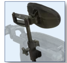
Headrest (optional) Multi-jointed support to allow for multidirectional adjustments.