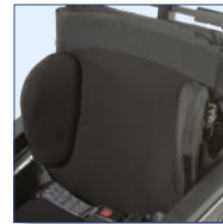
Thoracic supports (optional) Choice of four supports, in adult and paediatric versions.