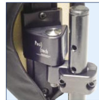
Support anchors (optional) Mechanism enables adjustment to patient's size.