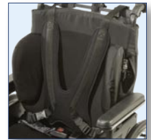
Breastplate (optional) Installation of breastplate with the addition of a backrest reinforcement bar.