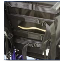
Soft canvas backrest (Std) Multidirectional adjustable tension.